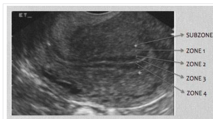
Figure 1: Ultrasound 2 Dimensional Grey scale measurement of Endometrial thickness.

The authors are thankful to ARC group of institutions and Saveetha Institute of Medical and Technical sciences for the providing the infrastructure and support for the conduct of study.