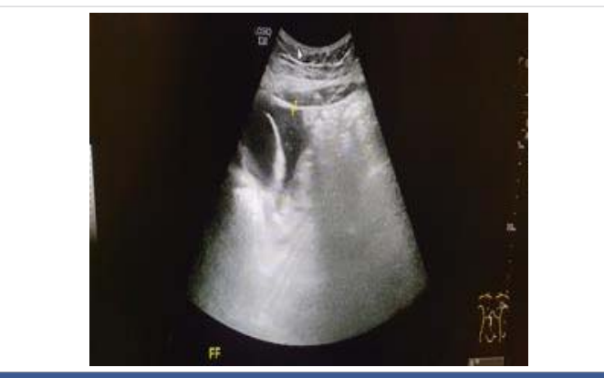
Figure 2: Free fluid surrounding liver & spleen demonstrated on US Pelvis.

Ms X was again reviewed by the surgical team and advised she receive peripheral Total Parenteral Nutrition (TPN) for