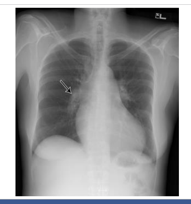
Figure 2: Chest X-ray P/A view showing Fleischner's sign(white arrow- enlarged main pulmonary artery) Bedside transthoracic echocardiography(TTE) showed moderate to large pulmonary embolism in the main pulmonary artery 8 mm distal to the pulmonary valve with mildly enlarged RA and RV(RV 36 mm).

Figure 1: Electrocardiography showing sinus tachycardia, inverted T waves, and Q waves in lead III and S wave in lead I.