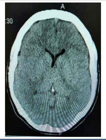
Figure 2: CT scan shows two pockets of gas within the left lateral ventricle anteriorly and posteriorly, no mass defect seen.

The typical symptom is moderate to severe postural headache which is aggravated on standing or sitting. On the other hand, the most common symptom of PC (Pneumocephalus) is severe headache having a sudden onset with gradual improvement over 4-5 days as the accumulated air is resorbed slowly and gradually with the passage of time.