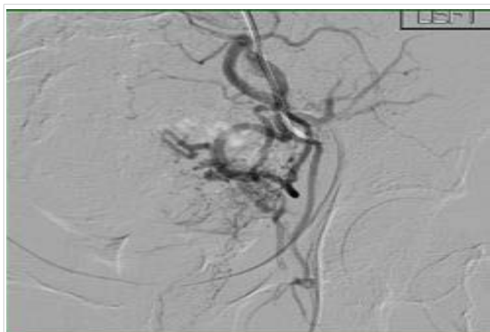
Figure 2: Digital Subtraction Angiography of pelvic arteries showing left hypertrophied uterine artery supplying the fibroid.