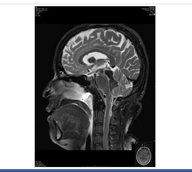
Figure 2: Shows computed tomography scan in sagittal section. It shows a bleeding area at part of the mid brain