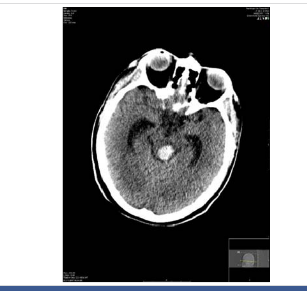
Figure 1: The computed tomography scans in axial section of the patient. It shows a bleeding area at part of the mid brain.

She was brought in our emergency department in 2017 with ambulance in unconscious condition. A multidisciplinary (Internal Medicine, Anesthesiologist, Obstetrics, team Neurologist and Neurosurgeon) was directly involved to assess the patient's condition. The obstetricians confirmed all the babies were vital. Due to a Glasgow coma scale of 3, the patient was intubated to secure her airway. Her blood pressure was 180/110. Following stabilization, cranial computed tomography (CCT) was performed. The result showed bleeding in the brainstem and into intraventricular spaces (Figures 1,2). The neurosurgeon performed external ventricular drain (EVD) to reduce intracranial pressure. Subsequently, the patient was sent into intensive care unit (ICU) requiring catecholamine and intrathecal thrombolytic therapy with Actilyse. A single course (two bolus injection with 24 hours interval) of antenatal steroids was administered using betamethasone 12 mg, in consideration of a high-risk pregnancy with complications. EVD could be removed on the sixth day of hospitalization. Daily visitation was performed to prove the vitality of the neonates. Cervical examination was done every two to three days. Unfortunately, on the fifth day of hospitalization, the patient suffered from pneumonia, proven by clinical and laboratory findings (Figure 3). The colleague decided to commence antibiotic treatment using