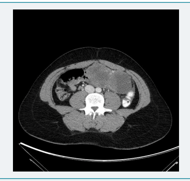
Figure 1: Abdominal CT-scan: large heterogeneous right adnexal mass. No evidence of ascites and carcinomatous.

The pathological analysis confirmed a right ovarian mass of 14 x 10 x 5 cm, weighting 380 g, with no sign of capsule rupture (Figure 3A-3B). Microscopic analysis showed the tumour was made of small cells with scanty eosinophil cytoplasm and irregular hyperchromatic nucleus, often harbouring a nucleolus. The mitotic index was high. Follicle-like cavities containing a lightly eosinophilic fluid were noticed inside the tumour (Figure 3C-3E). Immunohistochemical analysis (Table 1 for used primary antibodies) showed a prominent cytoplasmic labelling of vimentin in most cells, of synaptophysin in many cells but of chromogranin in only a few cells. Very rare cells showed cytoplasmic immunolabelling with an anti-parathormone antibody (Figure 3F-3H). A few cells showed a strong nuclear immunolabelling of p53 protein. There was no immunolabelling of cytokeratins AE1-AE3, CD99, smooth muscle actin, estrogen receptor alpha, progesterone receptor and only few cells showed immunolabelling of epithelial membrane antigen (CA 15.3). The diagnosis of small cell carcinoma of the right ovary, hypercalcemic type (SCCOHT) was proposed. Absence of immunolabelling of Brg-1 in the nucleus of neoplastic cells prompted us to look for a mutation of SMARC-A4. DNA was extracted from neoplastic cells and SMARC-A4 gene was amplified with the TruSeq Custom Amplicon kit (panel_diag_UGS_V1.1) and sequenced