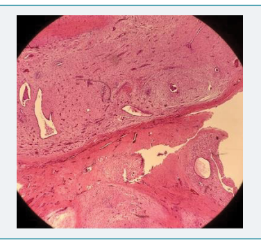
Figure 3: Histopathology of anterior abdominal wall showing endometriosis .

Since it is inherent in the very nature of the gynecologic-oncologist to go where angels fear to tread, I prevailed upon my junior partner to operate on this patient in the early second trimester of her pregnancy. The operation involved the removal of the lower anterior abdominal wall, including the rectus sheath and muscle. The enormous defect was repaired using an acellular dermal matrix. The total blood loss was less than 50cc's and she left the hospital in two days without complication. The final pathology report was consistent with endometriosis with extensively decidualized stroma, without evidence of trophoblastic tissue (Figure 3). It should be noted that she recovered more easily from the surgery than from the initial consultation, which advocated the termination of the pregnancy followed by chemotherapy.