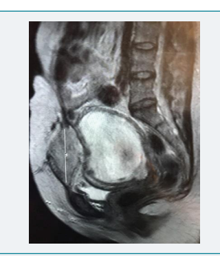
Figure 2: MRI of anterior abdominal wall

How to cite this article: Benigno BB. The Case of the Phantom Trophoblastic Tumor. Clin J Obstet Gynecol. 2018; 1: 024-025. https://doi.org/10.29328/journal.cjog.1001004